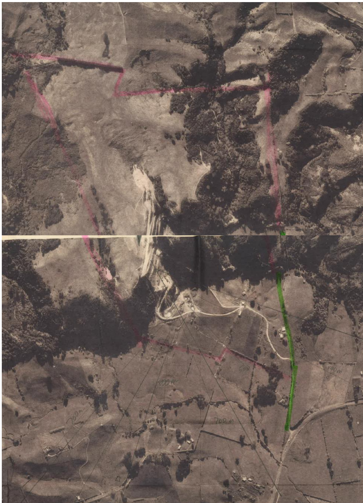
Appendix E – Historic Aerials of the Quarry