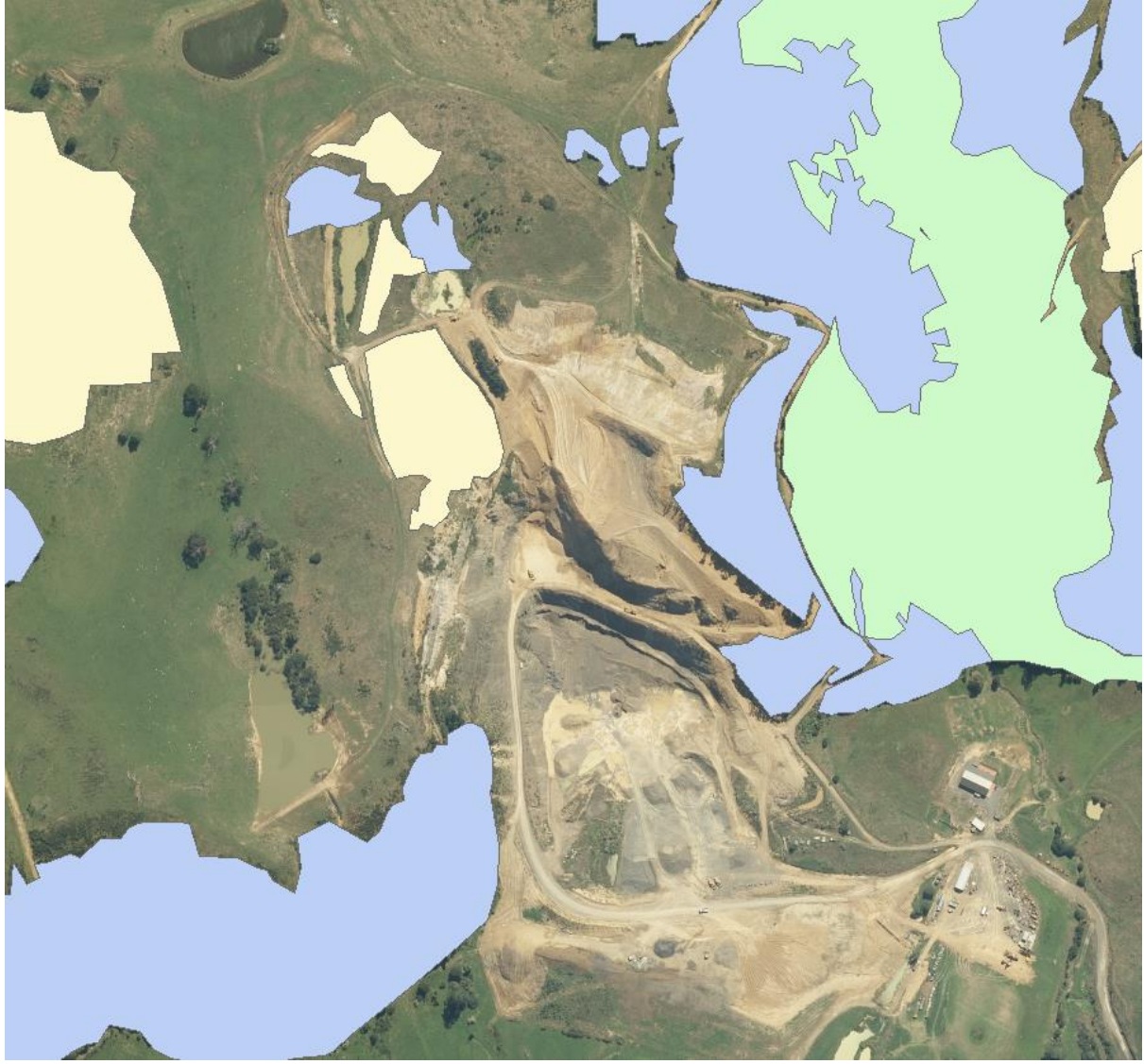
Figure 3 – 2017 WRAPS