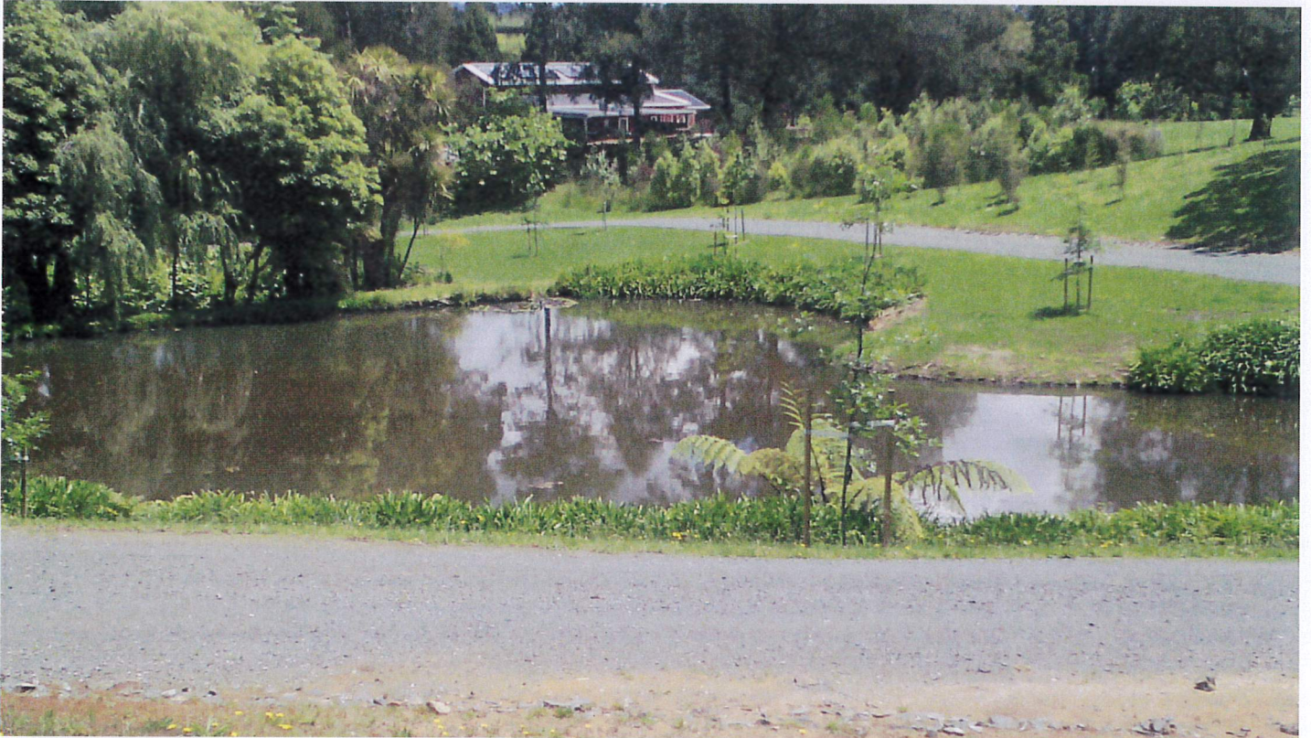
Looking west to Lot 3 and shed