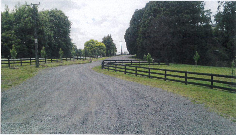
Existing (internal) access to serve Lots 8 & 9