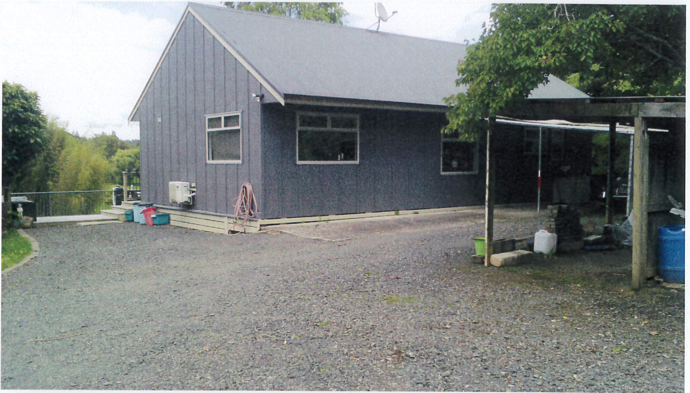
Existing former greenkeeper dwelling within proposed Lot 10