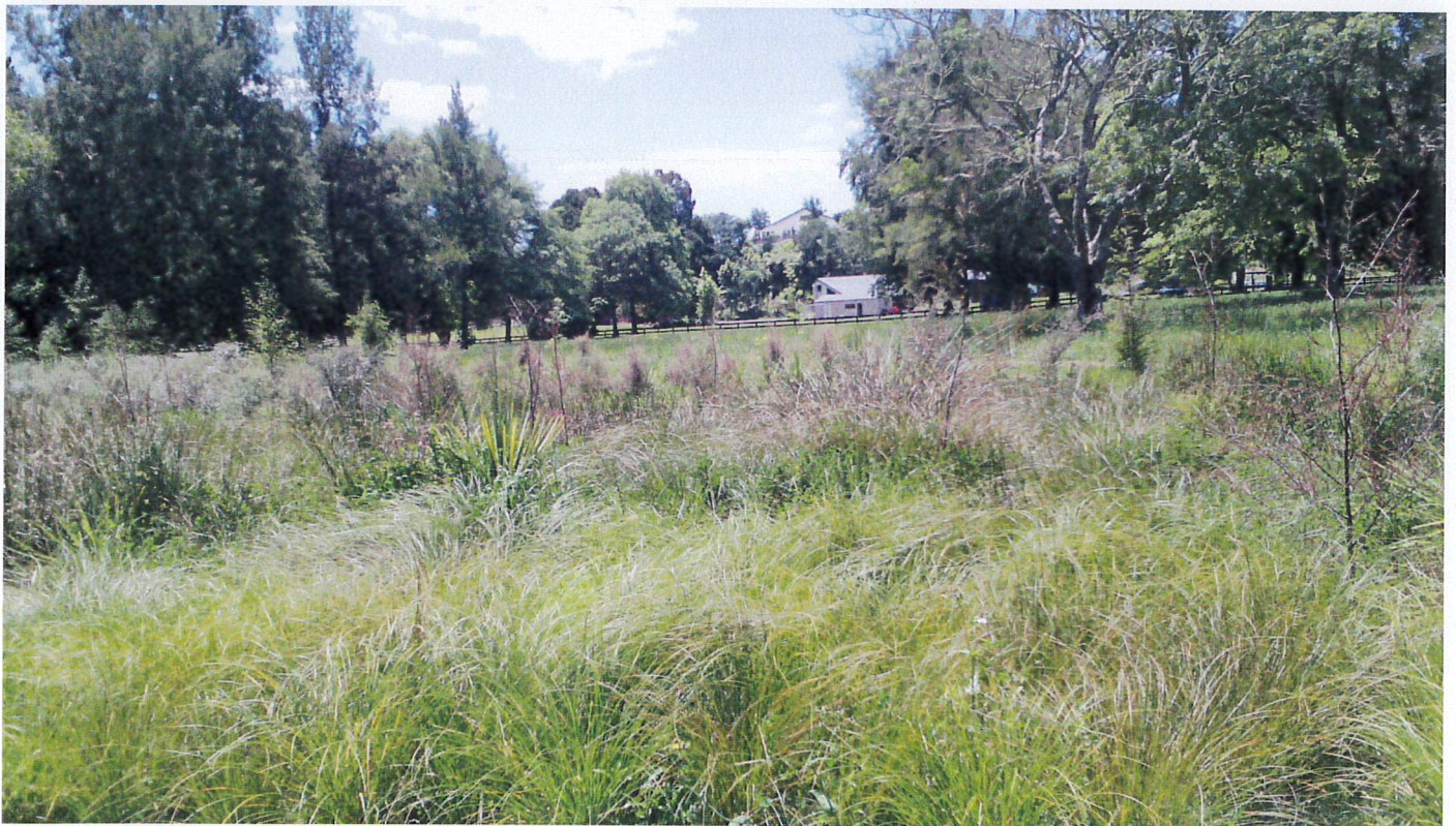
Wetland area looking north circa Lot 1