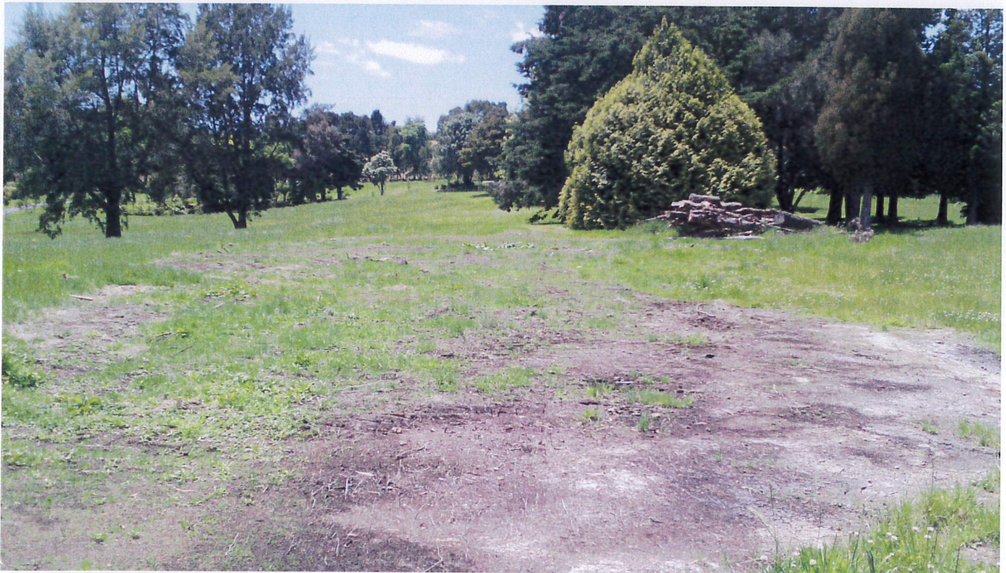
Circa Lot 5 location