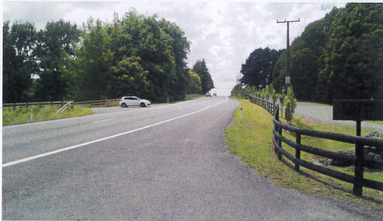
Existing access location looking east to Hamilton