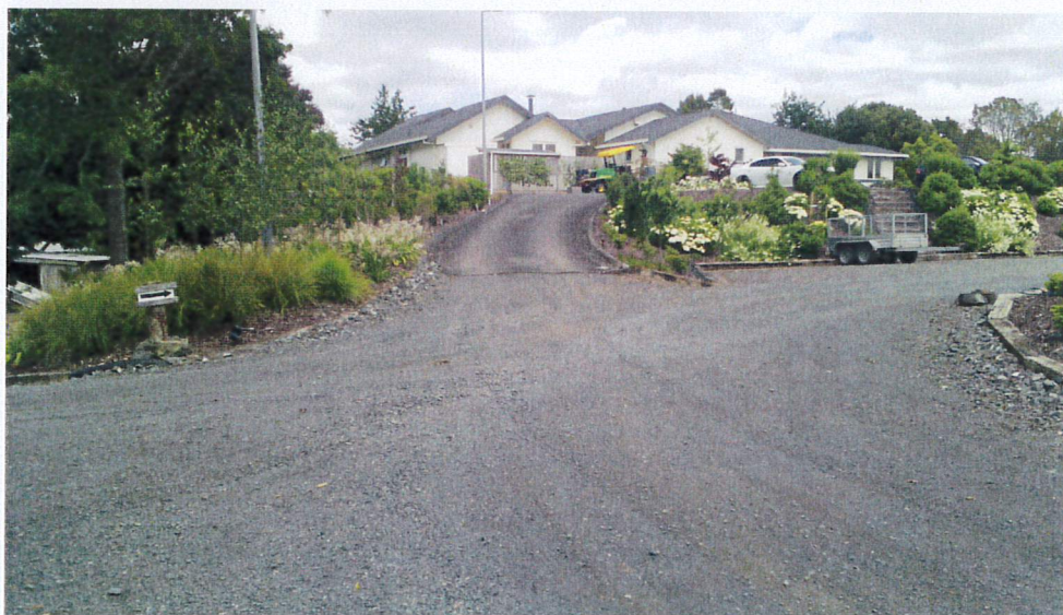
Internal access to former golf club room / Cardrona building (Lot 8)