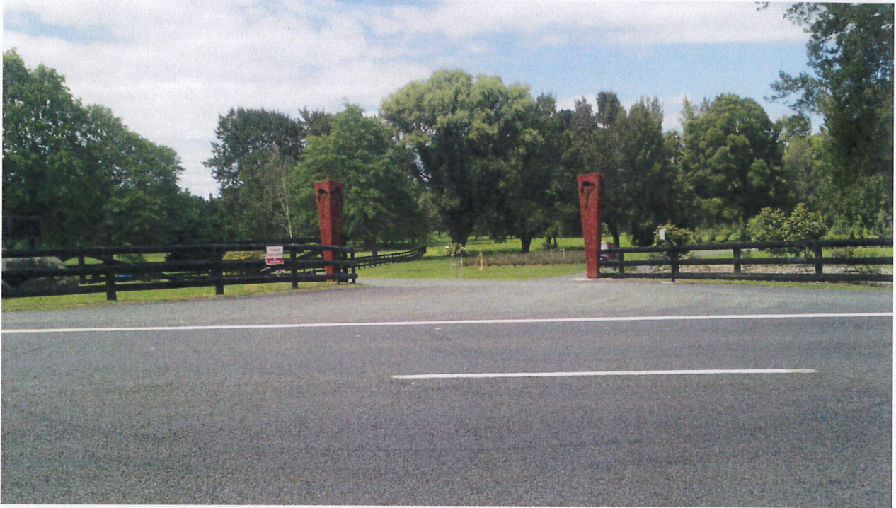
Existing access to site