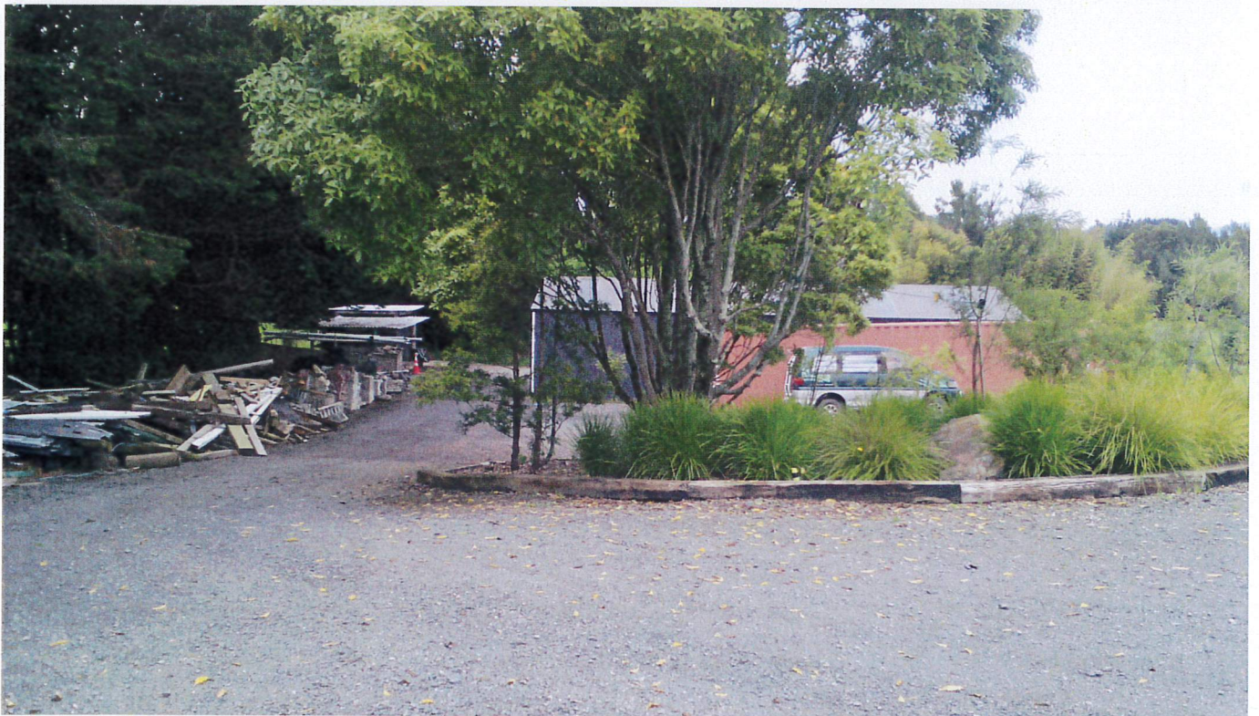
Utility shed within Lot 10 – the lot is also subject to unimplemented LUC 0192/19 192m 2 storage shed.