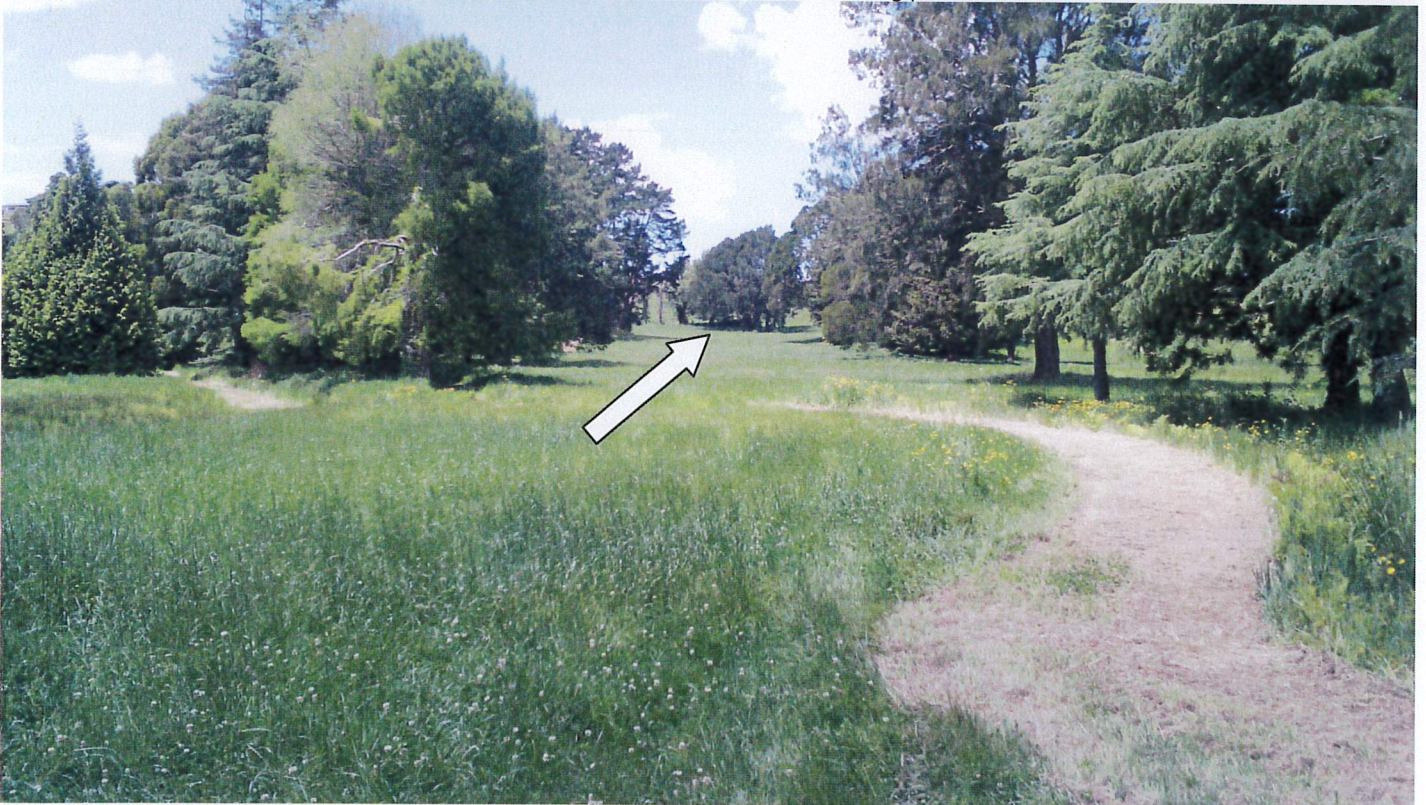
Looking to south east circa Lot 6 building platform