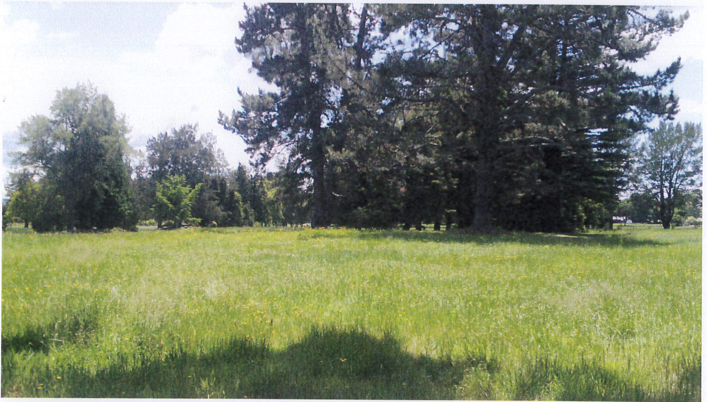
Mid site circa Lot 4 location