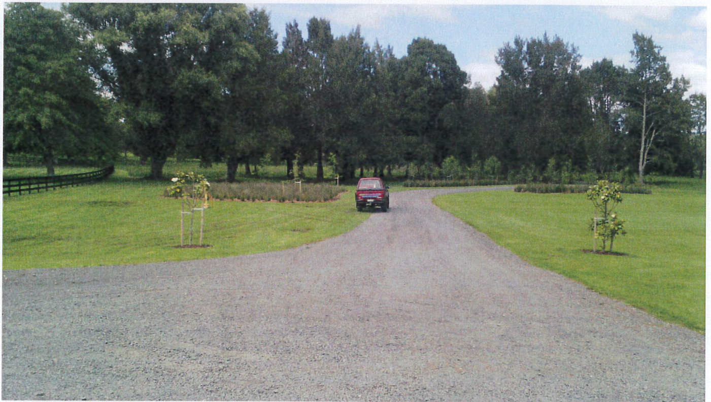
Internal access road servicing Lots 1 – 7 & Lot 10