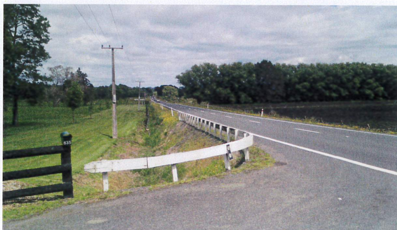
Existing access location looking west to Raglan