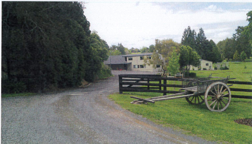
Internal access to proposed Lot 9 and former pro golf shop and cafe